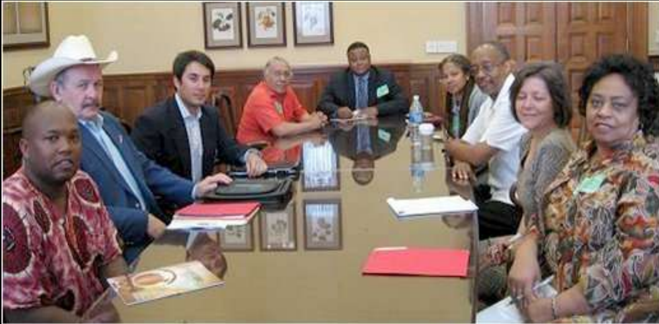
Members of Farm and Food Policy Diversity Initiative meet with USDA Chief of Staff Dale Moore and other USDA leaders immediately following passage of 2008 Farm Bill